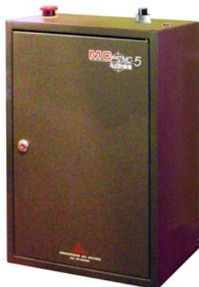
Winch Control Box