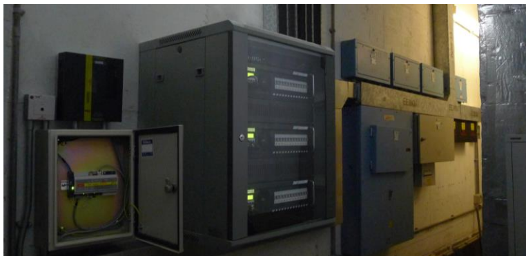
At the control room, the iLight Ethernet Gateway (bottom left) enables remote connection of the touch-screen controller inside the gallery with iLight DMX Source Controller (top left) to activate scenes and sequences. Lighting output is handled by 3 sets of Macostar MARS 12-channel Dimmer Packs (Centre).

2/F, Union Industrial Building, 48 Wong Chuk Hang Road, Hong Kong ☎ +852 2814 1881 ☎ +852 2814 9106 🌐 www.macostar.com ✉ sales.mhk@macostar.com