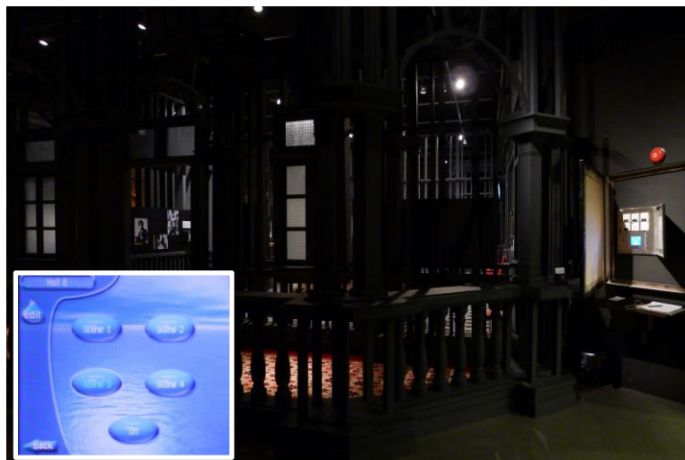
The 5.7" iLight touch screen controller with a tailored software-based control interface (bottom left), is installed inside the gallery. The controller has a full scene set programming functions with "PIN" security options which allows the user to adjust preset levels on lighting scenes.