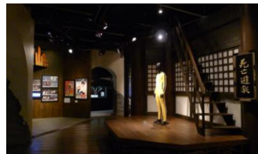
All the house lighting fixtures are grouped and programmed for the reconstructed scenes. Aesthetic dimming effects are then applied based on the scenes' requirements to enhance visitors' experiences in viewing the exhibition.