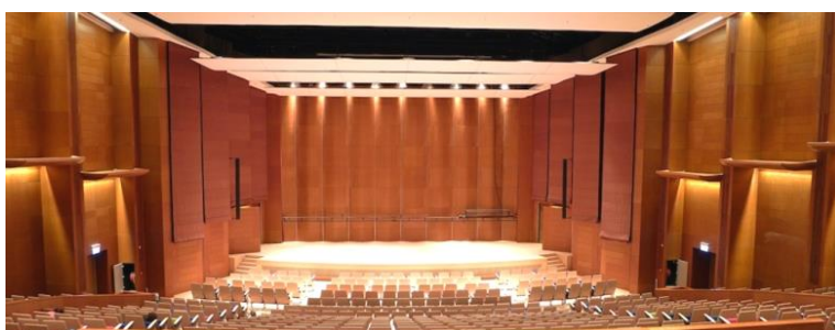
Macostar's Medley Double Scenery Bars above the stage.