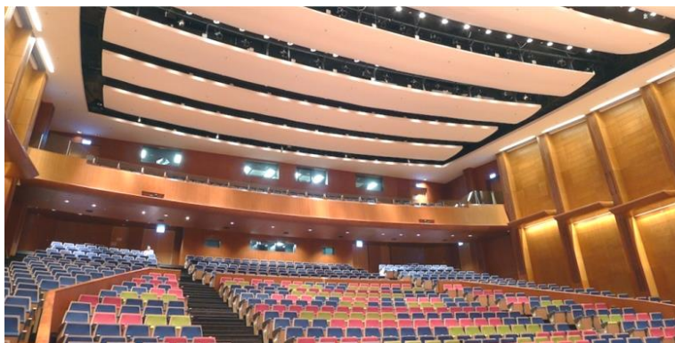
More than 50 Profile and Fresnel spotlights were installed.