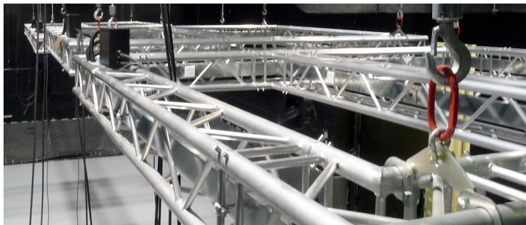
The aluminium truss system features Trabes Euro 29 series, which provides the user with an unbelievable loading capacity and versatility.