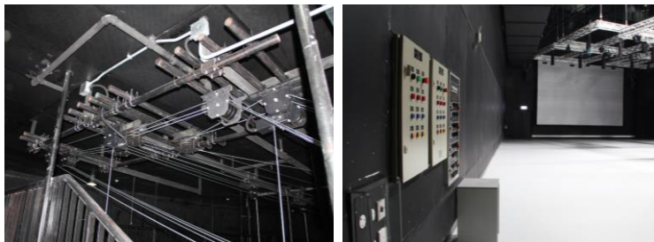
Eight rectangular aluminium trusses are suspended from the rigging system and controlled by the corresponding control panel.