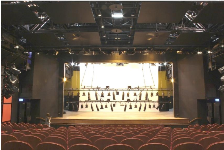
The auditorium has now restored with modern stage lighting facilities and motorised lifting machineries.