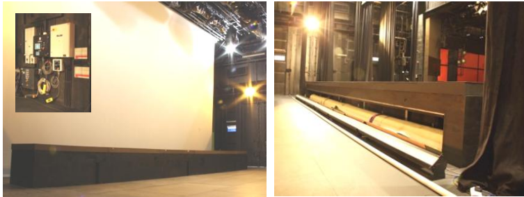
Carpet storage lift facing back of stage (right) can rise up as a stage platform (left), all managed by the lift machine control panels (top left corner).